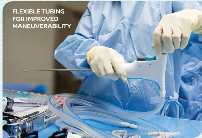
FLEXIBLE TUBING FOR IMPROVED MANEUVERABILITY