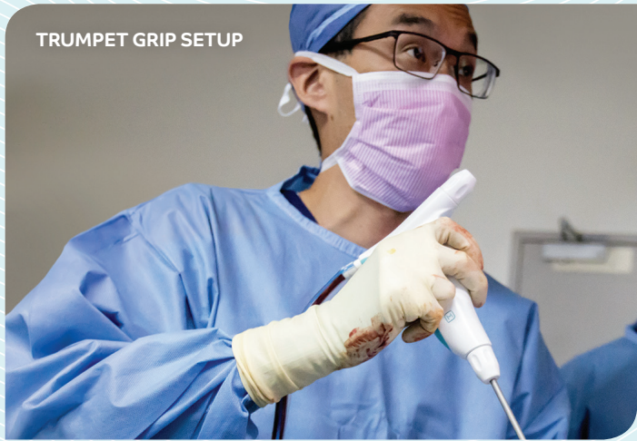
TRUMPET GRIP SETUP