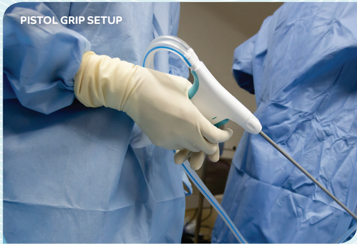
PISTOL GRIP SETUP